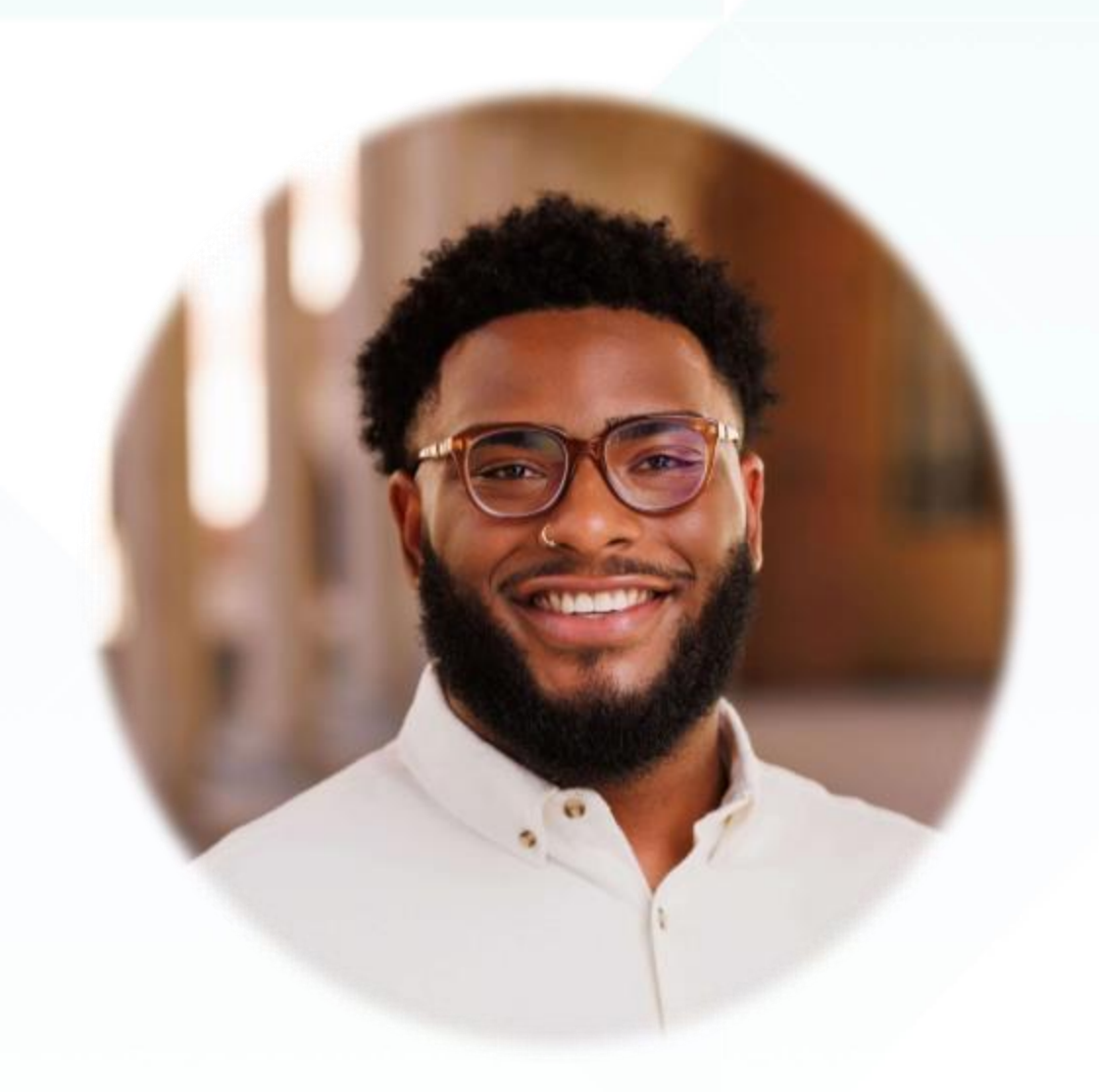
Transformative Support for Career-Track Faculty

The University of Arizona was honored as a 2023 Delphi Award winner for its transformative support of Career-Track faculty. This speaker series, made possible by the Delphi Award, is a collaborative effort between the U of A Career-Track faculty working group and Faculty Affairs. We aim to share insights and best practices for teaching and supporting career-track faculty.