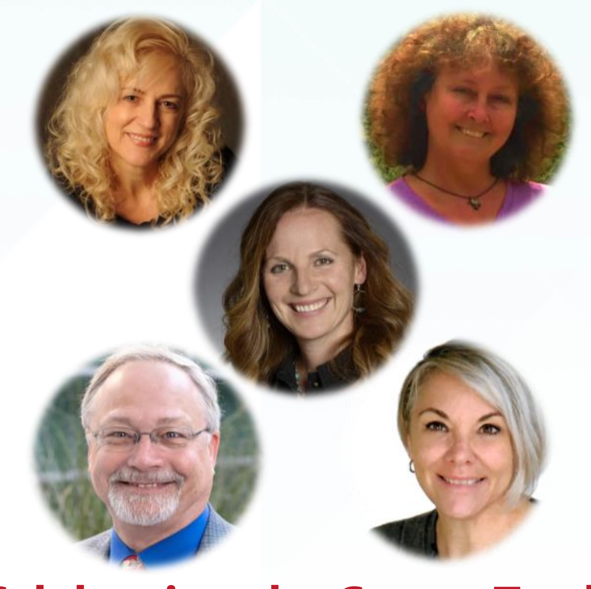
Celebrating the Career-Track Faculty Model Success: Insights from the Delphi Award